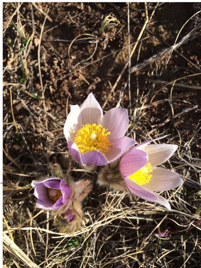
First Spring Crocuses.